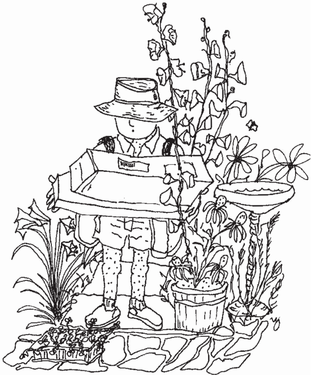
Letter carriers in Bloom