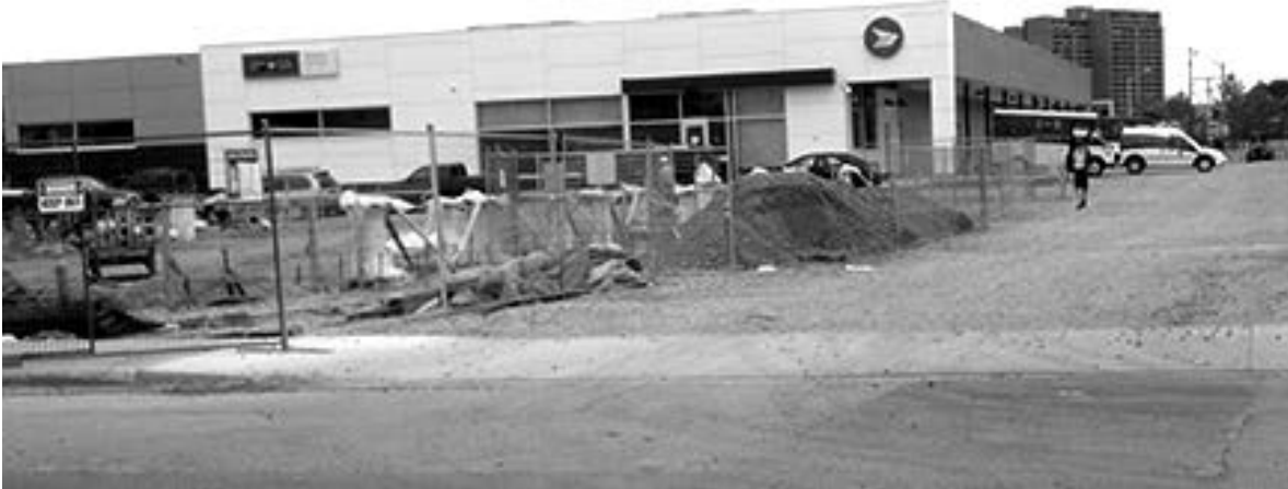
This is the new Edmonton Downtown Depot (EDDD). Depot 1, 11 and HUB have all been combined within.